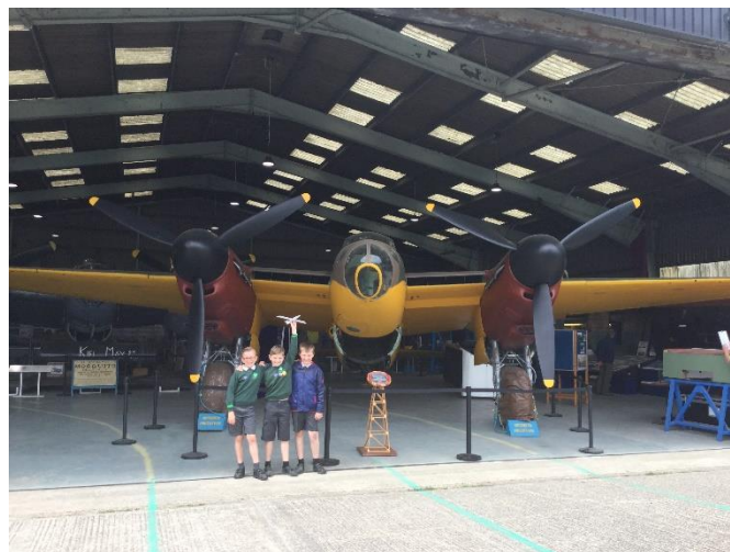
The 1st place team (5C) with their glider and the de Havilland DH98 Mosquito Prototype