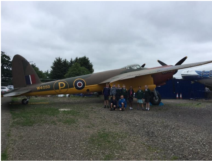
The whole group with the de Havilland DH98 Mosquito Prototype