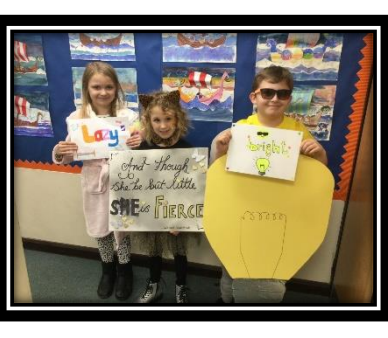
Can you guess which adjective they are representing?