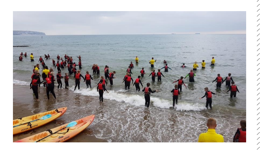
Y6 Adventure Week on the Isle of Wight and at the Science Museum 9^{\text{th}} - 13^{\text{th}} July 2018